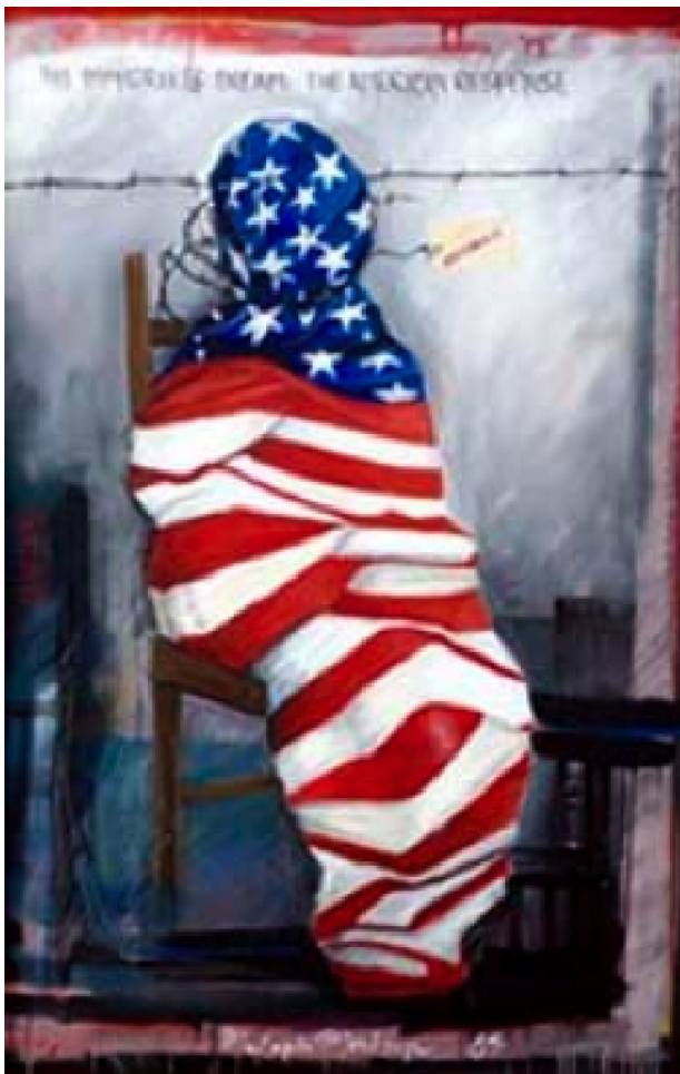
The Immigrant's Dream: The American Response

The pieces selected for this exhibition from the Cárdenas Collection consist primarily of Latino art that addresses an array of interrelated and overlapping issues affecting immigrant and migrant populations in the United States: globalization, poverty, free trade, human rights, and political disenfranchisement in both Mexico and the United States. To their credit, these powerful images communicate in an aesthetically compelling manner some very complex and deeply rooted dynamics to help understand current immigration issues beyond the level of mere appearance.