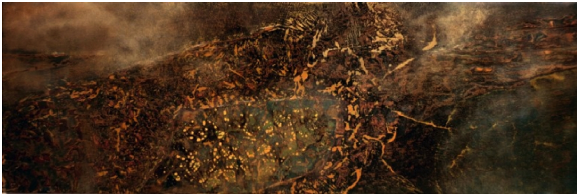
Nhat Tran, A Nonsensical Affection (2010)

Unveiled Layers: Exhibitions by Orie Shafer and Nhat Tran